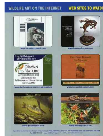
My brown trout is featured in the March/April issue (lower left photo).

tised in the national magazine, Wildlife Art . My work is displayed in the "Websites to Watch" section of the March/April 2005 issue. My work will also be in the upcoming July/August issue, so pick up a copy and have a look.