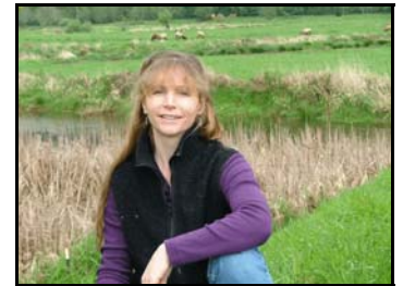
This was taken in April, 2005 at the Dean Creek Elk Viewing area, just east of Reedsport, Oregon. Note the elk in the background!

vacation at the coast. Although it rained for most of our trip, there were some dry phases and I was able to get some nice shots of elk, and various coastal wildlife (sea lions, birds, etc.)!