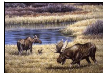
"Instincts" - 18" x 24" s/n limited ed. (200) print available for bid.

For more information about this event, call (541)757-7000 or visit the website at www.heartlandhumane.org .