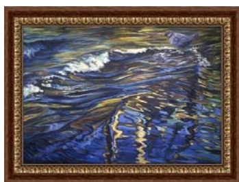
"Summer Reflections - American Dipper." 24" x 36" original oil on canvas, framed, $2,900.

Several people have expressed an interest in purchasing a limited edition, giclée canvas print of my