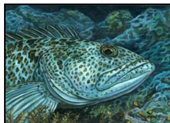
Lingcod study—5" x 7" oil on board.

the United States and Canada. My winning design will